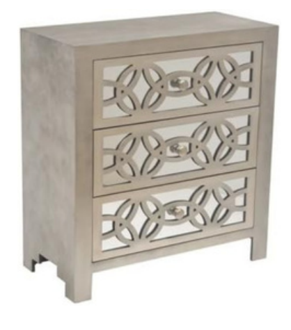
Or if you prefer drawers